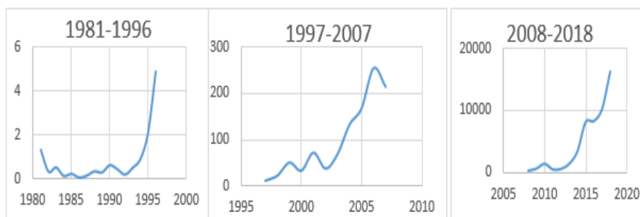
Fig. 2: Uncertainty in the food price index separately

Figure (1) shows the uncertainty of the food price index during the years 1981 to 2018, which is a turning point in 2010. So before 2010, fluctuations do not have a significant jump compared to subsequent years. The separation of this part of the diagram can be seen in Figure (2). After 2010, severe leaps have begun. One of the reasons for the beginning of these leaps can be attributed to the Iranian subsidy reform plan in 2010. Intensification of leaps are ongoing because of jumping in the exchange rate due to the intensification of unfair US sanctions against Iran in 2011 and decreasing in the country's oil production from 3481.2 to 3063 thousand barrels per day in 2013 (Central Bank, 2018).